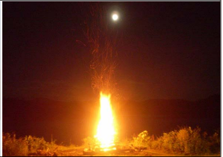
Are you ready for Banks' Army!!!