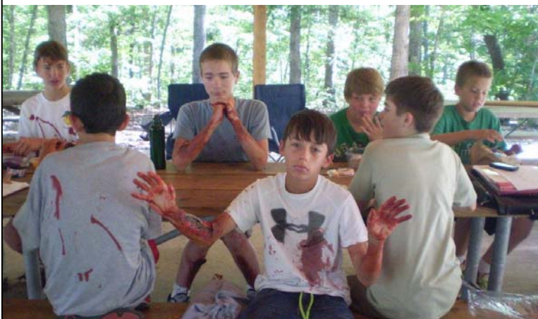
Mom - I promise you it's just mud!