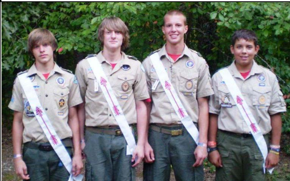
Troop 19's Newest Ordeal Members of Catawba Lodge