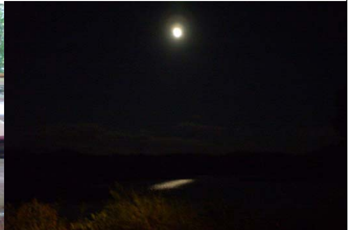
Moonlight over the Lake